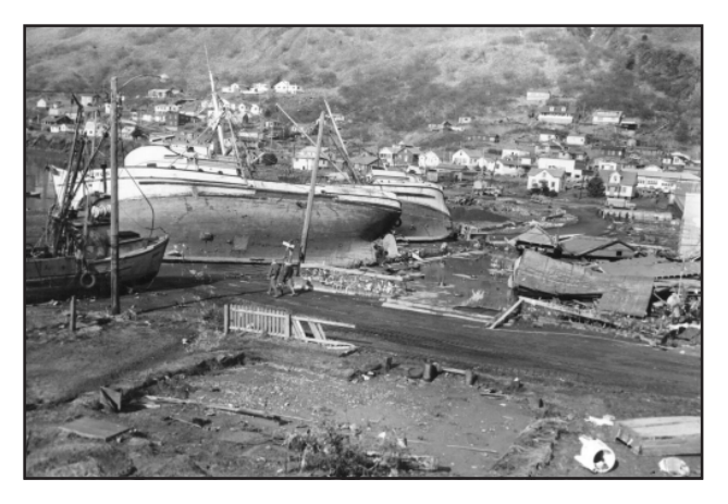
Figure 3. Tsunami damage in Kodiak resulting from the 1964 earthquake.