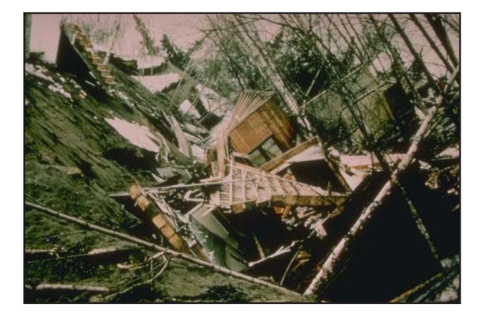
Figure 1. Destruction of homes in the Turnagain Heights subdivision of Anchorage during the 1964 earthquake.