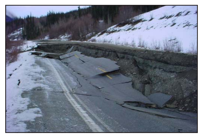
Figure 4. Highway damage along the Tok Cutoff during the magnitude 7.9 2002 Denali fault earthquake.