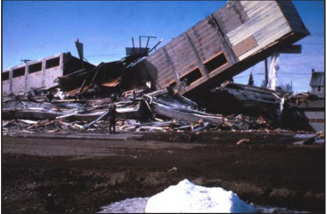
Figure 2. Collapse of the newly completed Four Seasons Apartment Building in Anchorage during the 1964 earthquake.